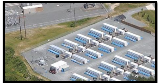
Figure 2 - Flywheel from Beacon Power, LLC in Tyngsboro, MA and the Stephentown, New York facility

Beacon's flywheel is essentially a mechanical battery that stores kinetic energy in a rotating mass. Advanced power electronics and a motor/generator convert that kinetic energy to electric energy, making it instantly available when needed. However, to do so these flywheels must be turning 24 hours a day, 7 days a week. Conventional metal flywheels would crack and fail under these conditions so carbon composite materials are used instead. 200 of these flywheels are located at one Stephentown, New York facility providing 20 MW of electricity to the grid instantly when needed.