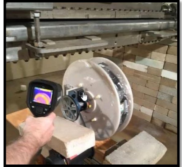
Figure 1 - Heat radiating from the flywheel sample can be seen on the hand help meter

This is where smart-grid technology comes into play. During peak energy use or when wind and solar contributions are low, stored energy is added to help stabilize the grid in the form of 32 inch diameter carbon fiber composite flywheels similar to the one shown in Figure 2 below from Beacon Power, LLC in Tyngsboro, MA .